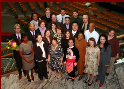
LA 13 - Class of 2010